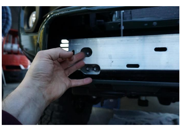
(iii) Crash Bar - bolts on each side

4. Carefully trim along line left behind the removed bumped cover.