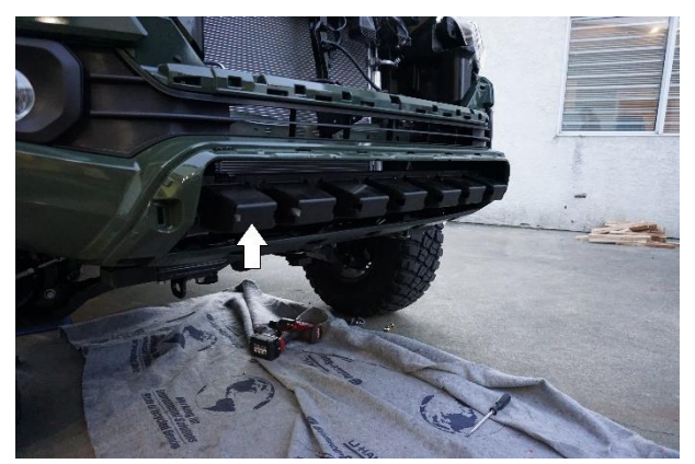
(i) Crash Bar Cover

3. Remove plastic Crash Bar Cover (i), Front Cross Bar Bolts/Factory Tow Hook (ii), and Aluminum Crash Bar (iii). Save the nuts, these will be reinstalled.