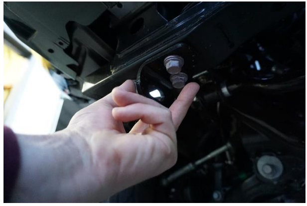
(ii) Front Cross Bar Bolts/Factory Tow Hook